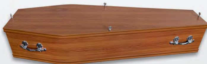
Wood effect coffin featuring flat lid and sides

We are here for you 24 hours a day 365 days a year